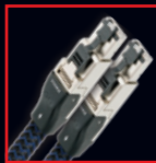
Up to 3.0 m. - Black/blue braid 5.0 m. and longer - CMG (CL3 & FT4) rated Black/blue PVC. Available in 0.75m, 1.5m, 3m, 5m, 8m and 12m lengths.