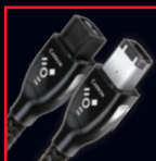
Available in 0.75m, 1.5m, 3m and 5m lengths.