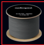
CMG (CL3 & FT4) rated PVC in White, Gray, Blue, Green, Yellow, or Purple. Available in 1,000 ft. spools.