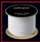
CMG (CL3 & FT4) rated PVC Charcoal w/ white stripes, Off-White w/ charcoal stripes. Available in 500 ft. spools.