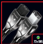
Available in 0.75m, 1.5m, 3m and 5m lengths.