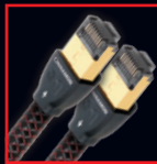
Up to 3.0 m. - Black/red braid 5.0 m. and longer - CMG (CL3 & FT4) rated Black/red PVC. Available in 0.75m, 1.5m, 3m, 5m, 8m and 12m lengths.