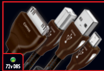
72v DBS Available in 0.75m, 1.5m, 3m and 5m lengths.