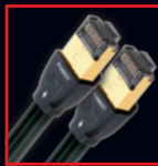
CMG (CL3 & FT4) rated Black/green stripe PVC. Available in 0.75m, 1.5m, 3m, 5m, 8m and 12m lengths.

Please don't handicap your Ethernet-based audio system by using standard cables. AudioQuest's Ethernet Cat6 and Cat7 cables provide a substantial improvement over "stock" cables.