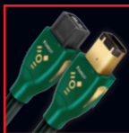
Available in 0.75m, 1.5m, 3m and 5m lengths.

Because high-speed digital audio data is just as susceptible to cable-induced distortions as analog signals are, AudioQuest's FireWire cables employ a series of superior materials and construction techniques to avoid corrupting and distorting the audio data. AudioQuest's FireWire cables start with solid Long-Grain Copper conductors and add increasing amounts of silver-plate to reduce distortion, with the top-of-the-line Diamond using solid 100% Perfect-Surface Silver conductors. Advanced manufacturing techniques and Solid High-Density Polyethylene Insulation ensure that stable geometry is attained, and also guarantees that the critical signal-pair geometry will not be compromised as a result of twisting and bending in everyday use. Both signal pairs are optimized for directionality, and in our top model Diamond, AQ's remarkably effective Dielectric-Bias System (DBS) dramatically lowers the perceived noise floor and raises dynamic contrast. All AudioQuest FireWire cables provide 100% internal shielding between highly-sensitive signal conductors and active power conductors. Please don't compromise the sonic performance of your computer-based audio system with generic FireWire cables.