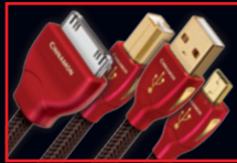
Available in 0.75m, 1.5m, 3m and 5m lengths.