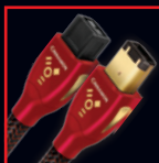
Available in 0.75m, 1.5m, 3m and 5m lengths.