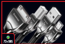
72v DBS Available in 0.75m, 1.5m, 3m and 5m lengths.