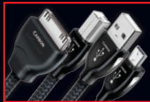
Available in 0.75m, 1.5m, 3m and 5m lengths.