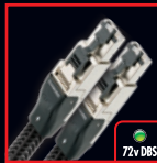
Available in 0.75m, 1.5m, 3m, 5m, 8m and 12m lengths.