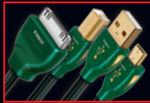
Available in 0.75m, 1.5m, 3m and 5m lengths.

Why short-change your beloved music collection with inferior-sounding generic USB cables when you can choose to use low-distortion, superior-sounding AudioQuest USB digital interconnects. Sit back, relax, listen, and enjoy!