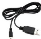
USB Cable x 1