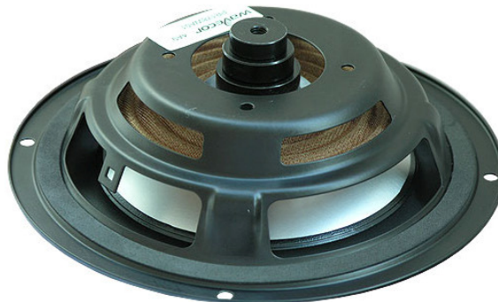
All 3 extra weights added at the same time (+35g)